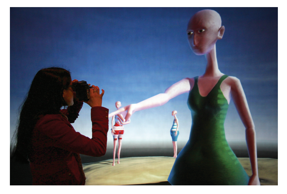
Empire of Sleep: The Beach. © 2009 Alan Price

Alan Price's interest is in creating new forms of interactive and virtual cinema, in which the viewer's experience is informed by alternate methods of both display and user input, creating an intuitive and visceral sensation for the viewer in extending his or her reach into the space in which the story or event unfolds, creating virtual worlds that have awareness and responsiveness to the presence of the observer. It is not about user intervention or control of the story, but rather the symbiotic relationship between the observer and the narrative event. Price is interested in designing physical user interfaces that are thematically interpretive of the subject matter represented in the work and, more importantly, that allow the viewer to feel as if physically extended into the virtual space, giving a sense of embodiment and immersion that dissolves the separation between the two. This is not limited to methods for engaging multiple senses or surrounding the viewer to make him or her feel physically immersed, but investigating ways in which actions and their familiarity, such as taking a photograph, provide a sense of playing a role and of being integral to the representation of events taking place.